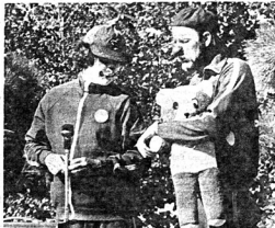
Wavy Gravy, holding the Birthday Party's mascot, and a member of the Hogs Farm at the Nobody for President rally.

Nobody's credentials came out during the rally: nobody balanced the budget, nobody lowered taxes last year, nobody stopped the war, and nobody is feeding the hungry.